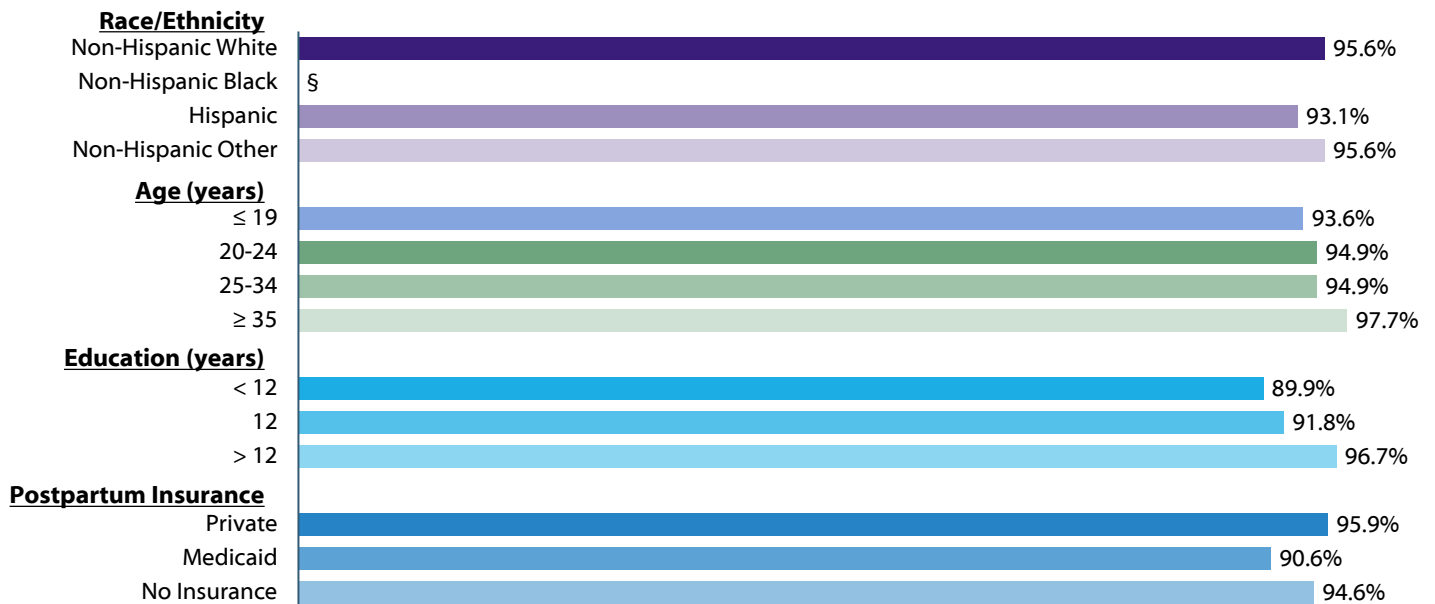
Mothers who reported ever breastfeeding, by selected characteristics — Utah, 2014